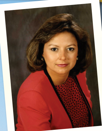
Elected DA in 1996