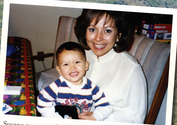
Susana was named "Woman of the Year" for her work with children's advocacy and keeping our children safe

Susana Martinez has been overwhelmingly re-elected District Attorney of Doña Ana County – a county that's 2 to 1 Democrat. She has earned the respect and support of New Mexicans across the political spectrum as a leader willing to fight for what she believes in – even when it's unpopular.