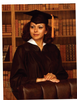
College graduation, later she earned her law degree